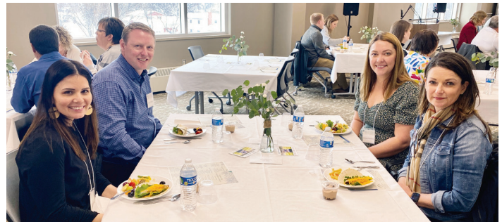
TruStone Wealth Management