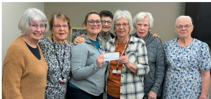
The UMC Auxiliary recently donated $1,000 to the UMC Pediatric Therapy Department for new art in the waiting room and treatment rooms. See story above for more information.