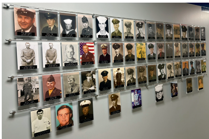
Unity Medical Center hosted a Veterans Wall 1st Anniversary Social on Veterans Day, Nov. 11. The wall is currently home to just over 250 photos of area veterans.