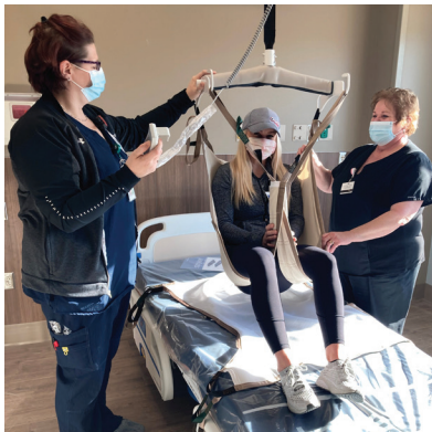
Unity staff received training on the new patient lifts that safely carry a patient from the bed to the bathroom and back again without injury.