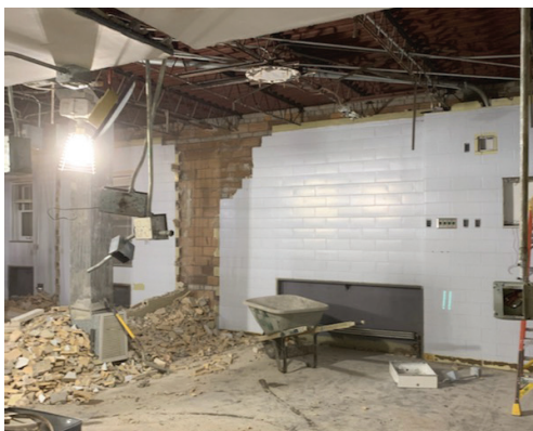
Bricks in the old emergency room and surgery suite are being torn down to make way for the new Emergency Department that will connect the old building to the new building this spring.